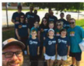
MEADOWBROOK FWB Black Mountain, NC

laundry mat and passed out popsicles in the park. The team from Peace Church were such a blessing and did an great job sharing Christ in Hickory.