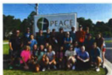
PEACE FWB Wilson, NC

In June, we were blessed to have Peace Church in Wilson, NC bring 18 middle school students and 5 adults to help with several outreach opportunities in Hickory. Our team was able to volunteer at the Salvation Army Soup Kitchen and the Hickory Parks and Rec. cleaning up the Glenn Hilton Park. We also held a Loads of Love event at a local