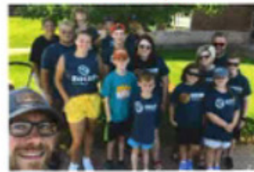
UNION CHAPEL FWB Chocowinity, NC

In July, Union Chapel FWB in Chocowinity, NC brought a group to help with several outreach projects as well. They were able to help with door-to-door outreach and some activities in our local park. UC also attended our third service where several first-time guests attended as well. One of those guests came because of the outreach efforts that weekend.