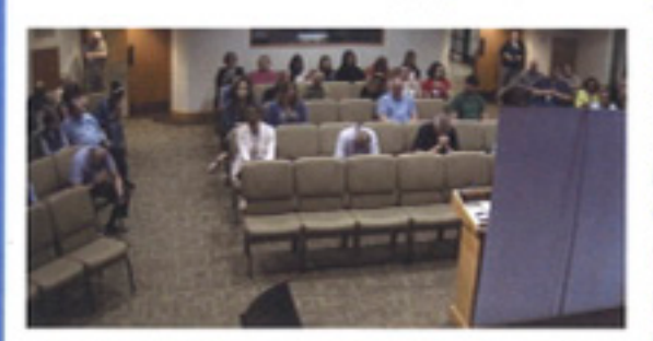
Cary staff gothers to pray during a Ukrainian update

Overall, the number of givers and amount of giving to TWR is up from last year. This enables work to continue on projects like