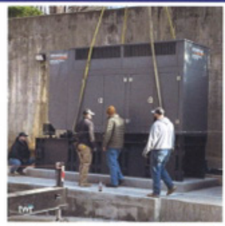
Installation team works with TWR staff to install a new generator at the int'l corp. office

translation, radios for Africa, global website updates, and improvements to infrastructure such as tower maintenance and transmitters. With amazing generosity, a new generator was recently installed in Cary to help maintain power to servers, workstations, and everything else in our corporate office in case of power outage.