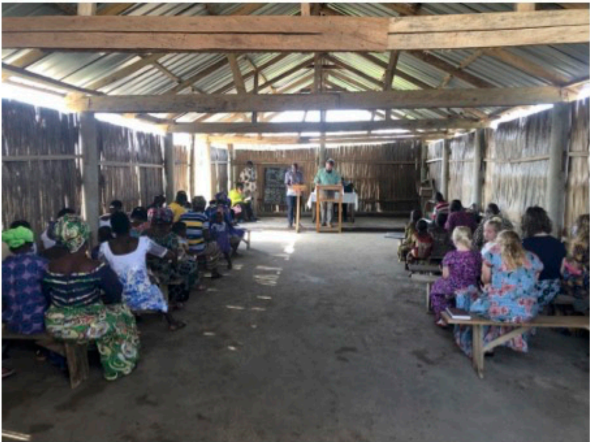
Typically the men and women sit separately on either side of the church. When we arrived, the ladies side was already full so we sat on the empty benches on the